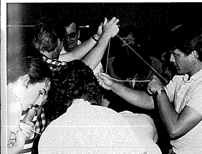
Learning how to sew their clothes together wasn't so easy for the faculty during the Junior Olympics.